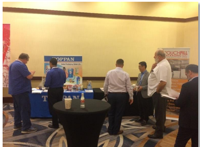
Toppan USA and Pouchfill tabletops in GLOBAL POUCH FORUM 2018 in Miami, FL

*Toppan to display New Recyclable High Barrier Film Grade