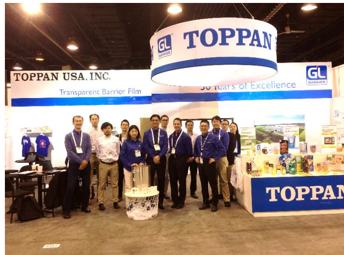
Toppan USA's booth in Pack Expo International 2016 in Chicago.